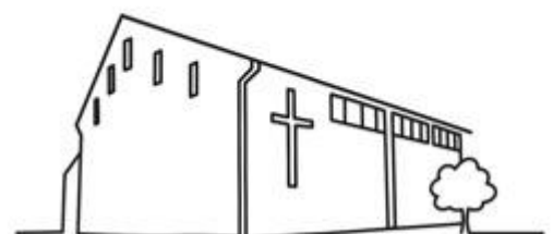
St Wulstans Church

Much of the life of faith in a parish unfolds through steady, repeated acts rather than dramatic moments. Season in, season out we share the stories of the church's year. This is in our own weekly services and also in friendships with the Scouts, Regency School, Oasis Academy and others in the area. Home communions continue quietly in living rooms and care homes. Behind the scenes the bills are paid, the website is updated, tea is made before services, and in due season the Christmas tree is put up again. If we could take a photograph of every moment, the life of our parish would fill gallery after gallery!